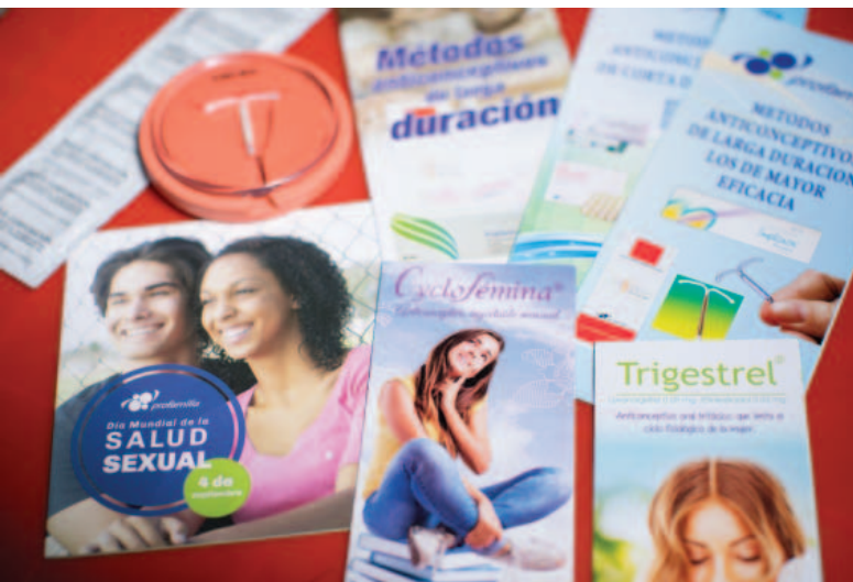
Information on sexual health and contraceptive methods at a clinic in Santo Domingo, Dominican Republic.