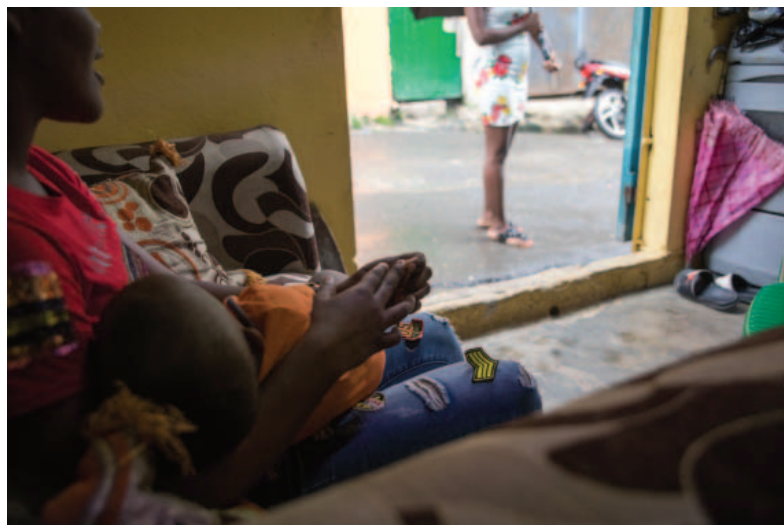
A young woman, 18, holds her son and talks to a friend in her neighborhood in Santo Domingo, Dominican Republic. She left school when she first became pregnant, but now takes classes on Sundays while her partner watches her child.