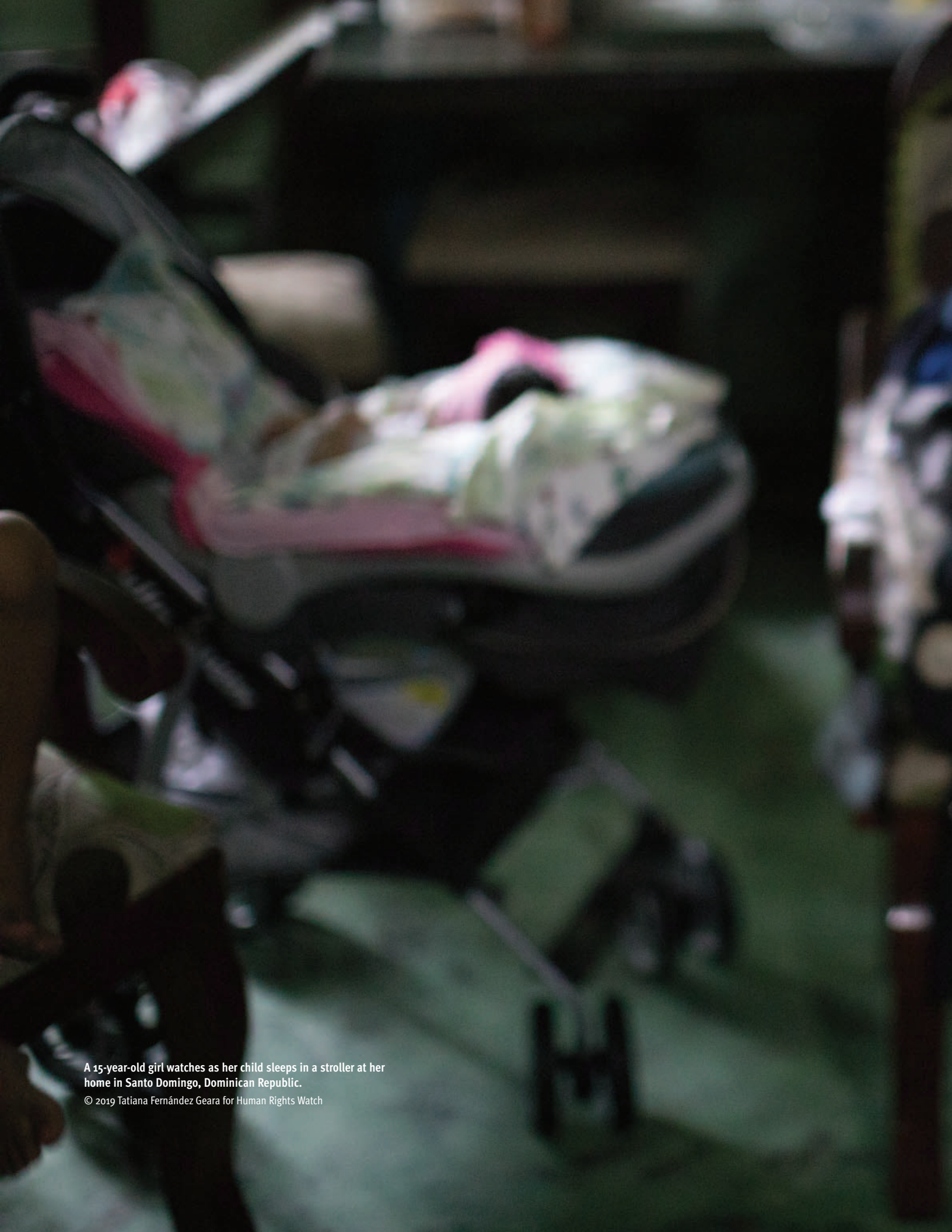
A 15-year-old girl watches as her child sleeps in a stroller at her home in Santo Domingo, Dominican Republic.