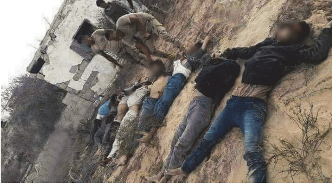
In at least two incidents, Human Rights Watch verified extrajudicial executions by government forces in North Sinai. This picture, provided to Human Rights Watch by a Sinai activist, shows the bodies of victims of extrajudicial executions by the army in April 2017.

Three Sinai residents confirmed to Human Rights Watch that the executioner was a well-known militia member from Sheikh Zuwayed whom they knew personally. 193 An Egyptian Military Intelligence officer, recognizable by his military uniform arm patch, appeared to be observing and directing the first execution, and the soldiers appeared to use the US-made Humvee vehicles to transport the detainees. 194 In December 2016, before the video was leaked, the army posted an official statement on Facebook with images of the slain individuals and weapons placed next to them, claiming they were “armed terrorist elements” killed in a security raid. 195 Activists in North Sinai reported that the two of the victims were brothers, ages 16 and 19, whom the army had arrested from Rafah and forcibly disappeared in July 2016. 196