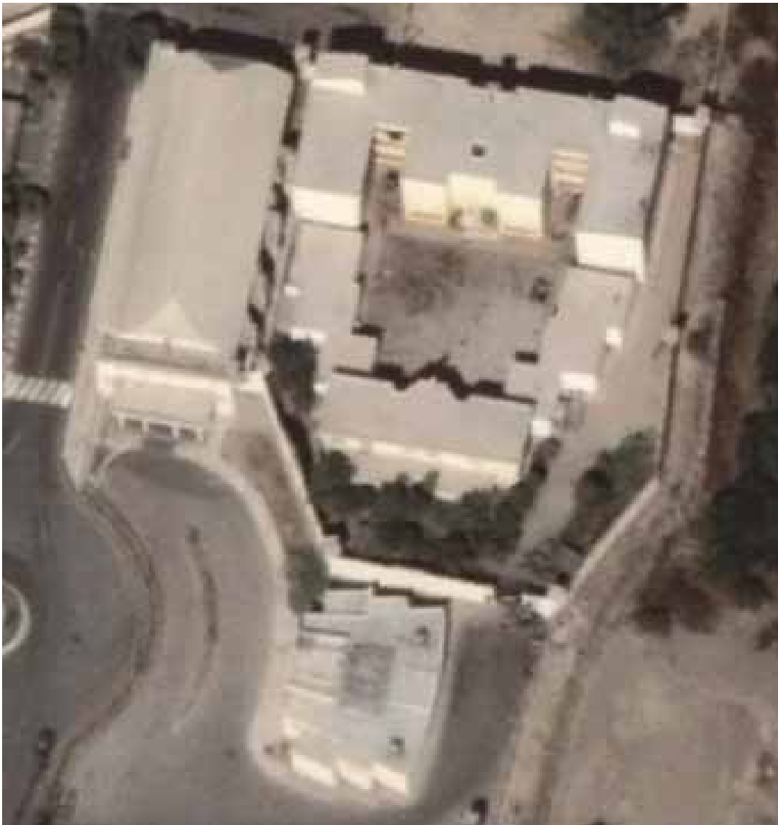
Satellite Imagery: Al-Azoly prison building in al-Galaa Military Base, October 12, 2017. Satellite imagery © DigitalGlobe 2018; Source: Google Earth.